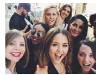
Group selfie time!