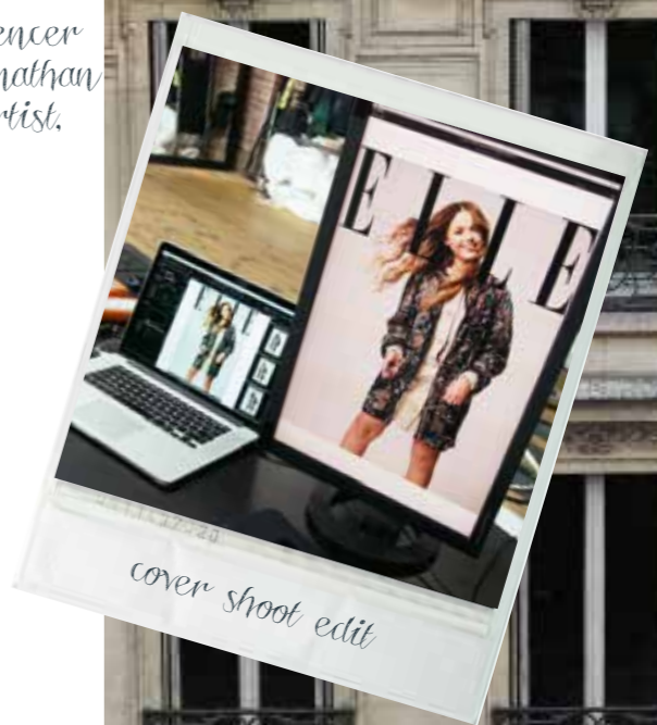
cover shoot edit